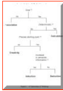
Figure 1. A taxonomy of thinking

human memory system is called "inductive." Inductive and deductive thinking together constitute the category of problem solving.